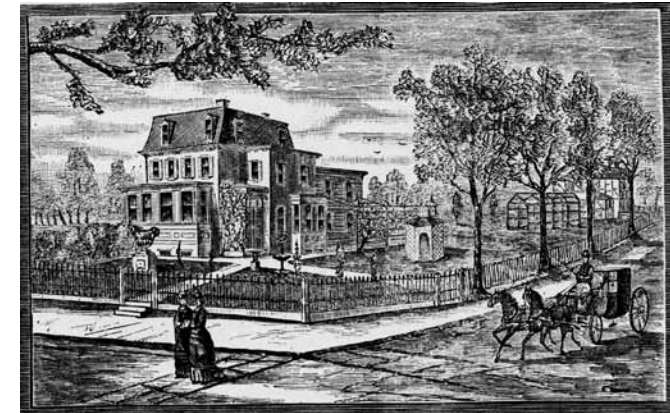
From Presbyterian Home for Aged Couples and Aged Men at 65th and Vine Streets, founded 1885.

Even when it appeared in the late twentieth century as if both the city and the presbytery were locked in a spiral of retreat and retrenchment, the seeds of renewal were already sprouting. The Philadelphia region began to grow again as it transitioned to a “knowledge economy” based on medicine, education, technology, and communication. After decades of depopulation, the region is now experiencing a net inflow of people, many of them younger and better educated. Center City hums with nightlife, cultural institutions are diversifying, and whole neighborhoods are repopulating and rebuilding. At the beginning of its fourth century, the Presbytery of Philadelphia is busy reinventing itself as a decentralized mission support movement, concentrating its energies on its congregations’ local initiatives, on innovative ministries, on repurposing old buildings, and on new worshipping communities—all served by a smaller and more affordable professional staff.