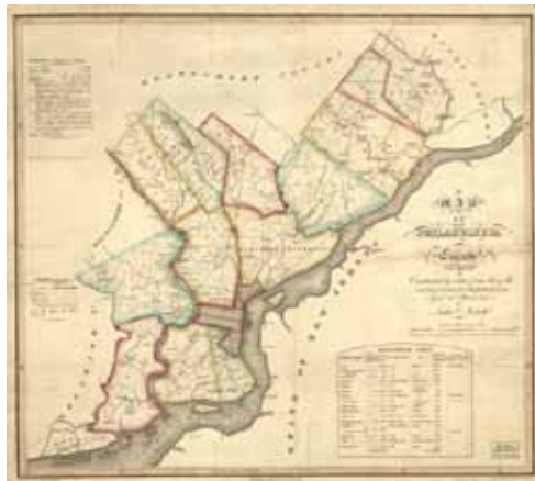
Map of Philadelphia County: Melish, 1819.

The mission of the presbytery in its first century was to perform the basic functions of a governing body. It organized congregations, examined and received new ministers, prepared and ordained candidates for the ministry, reviewed the work of the churches, supplied pulpits, disciplined the errant, and arbitrated local disputes. The sheer size of the area under its supervision—originally all of south Jersey and southeastern Pennsylvania—meant that the presbytery had only such authority over its churches as the congregations were willing to give it. It is a measure of the power of moral suasion and their desire to be supplied by a learned ministry that they did submit to the written admonitions of a distant church court.