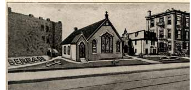
From Berean Manual Training and Industrial School Records, 1914-1922.