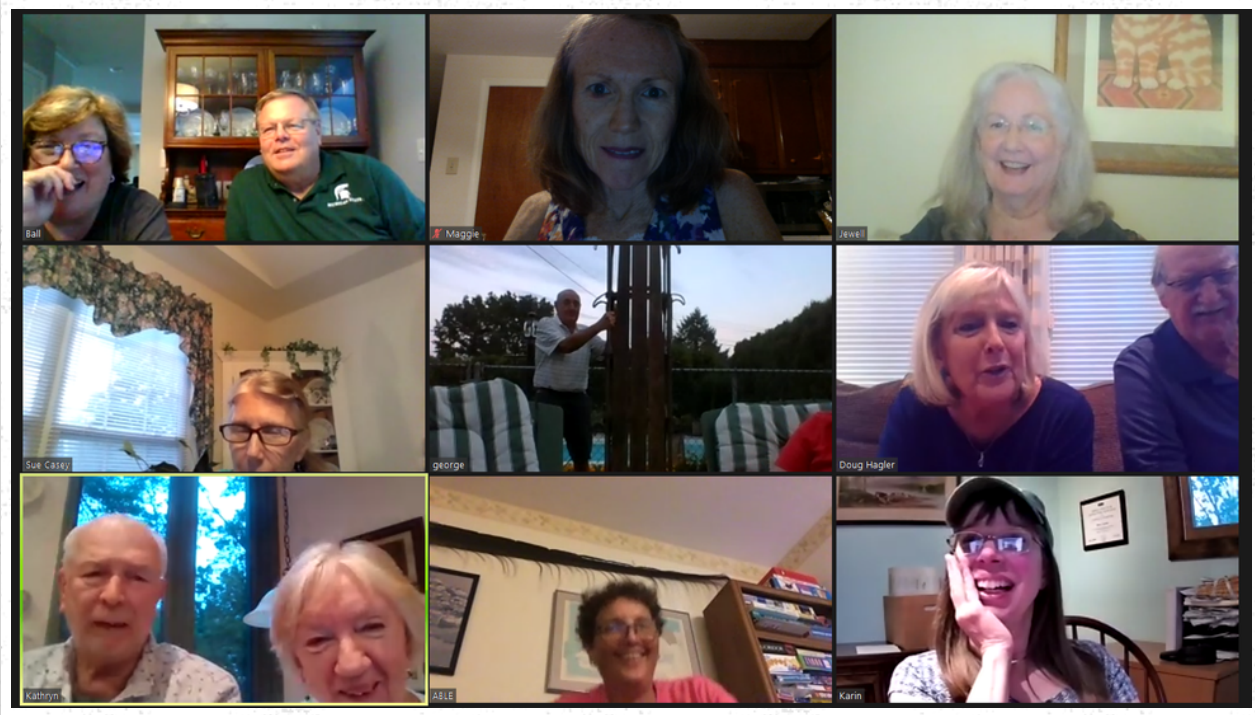
From FPC's Antiques Road Show - Wednesday, August 26th