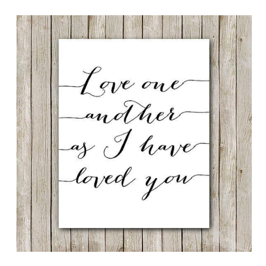
Morning Worship May 9, 2021 ### 10:30 a.m.

https://www.youtube.com/channel/UCrmNs7JdvZNJpsNjs0Ds8vg.