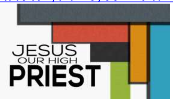
Morning Worship October 17, 2021 ### 10:30 a.m.

The recorded version will be available for "anytime" viewing. <a href="https://www.youtube.com/channel/UCrmNs7JdvZNJpsNjs0Ds8vg">https://www.youtube.com/channel/UCrmNs7JdvZNJpsNjs0Ds8vg</a>.