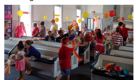
Balloons equal fun for kids at Byron Presbyterian

Two years ago Byron was the recipient of a Presbytery grant which was used to purchase sewing machines and material. These are now being used to make face masks that are given out free to those who need them including area farm workers.