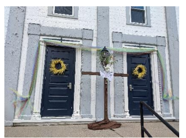
Church doors were decorated for Easter while 120 people worshiped virtually