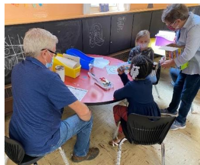
... and to grow!