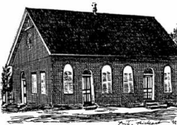
Nazareth early 1900's