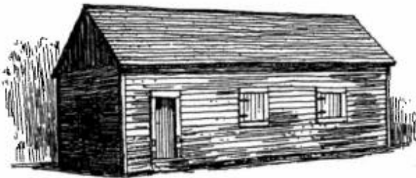
1785-1790 Frame Meetinghouse