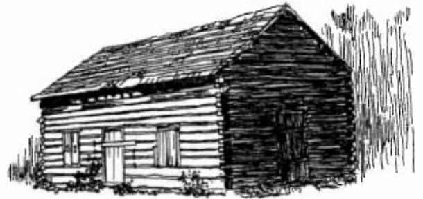
1765 Log Meetinghouse